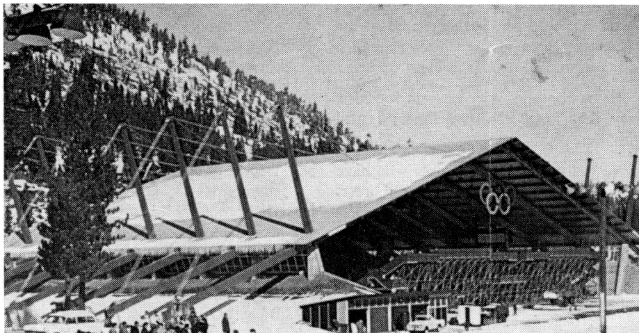
"Tabernacle; Squaw Valley"

God's own people met in two locations in the United States, as well as in London, England, and other parts of the world. Yes, God's Feast of Tabernacles is now being kept world-wide, giving us a little glimpse into the future when the whole world will keep the Feast in the millennium.